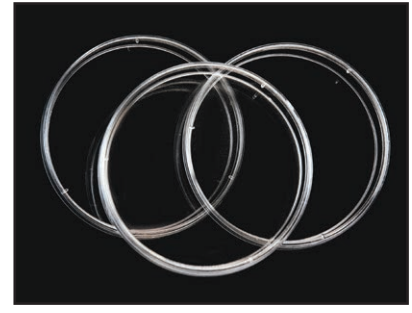
Manufactured from virgin-grade polystyrene for optimum clarity and quality