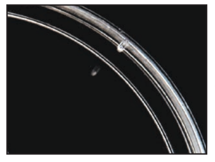
Ventilation ribs allow for free air circulation and reduce condensation during incubation