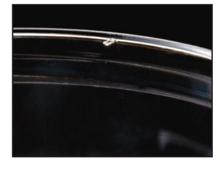
Lid designed for optimum stack stability